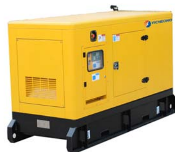
Super silent canopy