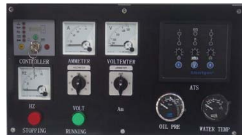
Standard Control Panel